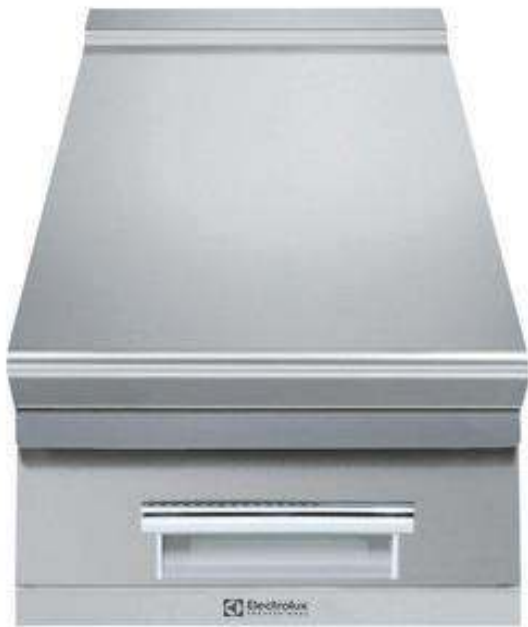
391546 (E9SSBGAOMCE) Ambient worktop with drawer and 3mm worktop, 1/2 module